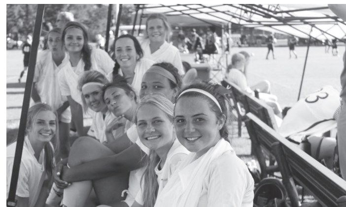
The Lady Governor's soccer team sits together on the bench during the ESD tournament in Pierre on September 23rd

in the tournament and one step closer to a state title!